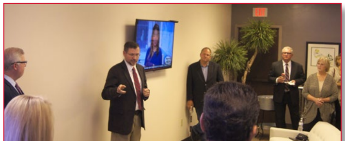
Senator Terry Bruce addresses the contractors