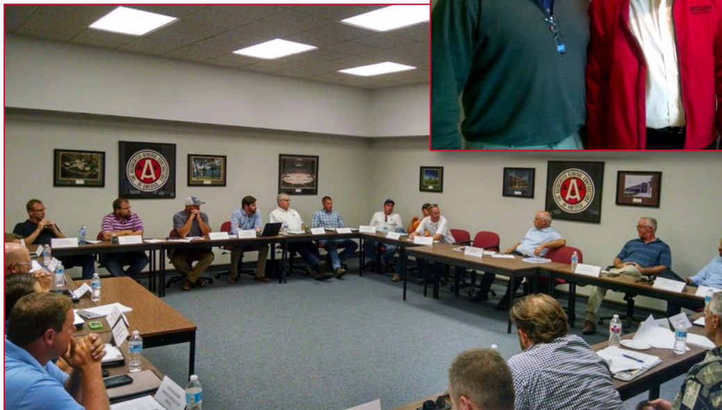
Subcontractor Council Industry Roundtable “Best Practices” Forum in Topeka