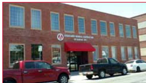
New AGC of Kansas office in OLD TOWN WICHITA

AGC of Kansas will continue to maintain its Legislative Affairs office, located at our legislative consultant’s office (Watkins & Schneider), in the Core First Bank Building in Downtown Topeka. An OPEN HOUSE is being targeted for late September/early October and we expect to see many of our members, design professional partners, policymakers and many other industry professionals at this open house. LOOK FOR AN OPEN HOUSE ANNOUNCEMENT SOON.