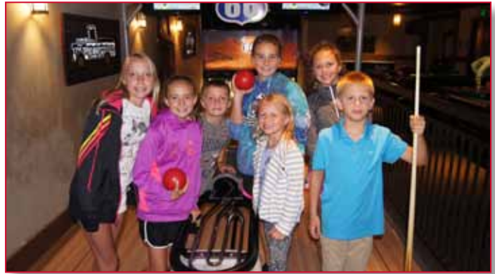
AGC family members enjoying some bowling