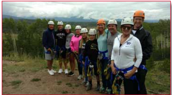
AGC members participate in a "ZIP LINE" team building exercise