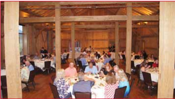
Closing Board Retreat Dinner