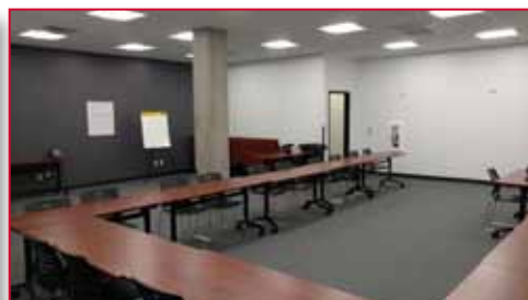
Large Conference & Training Room