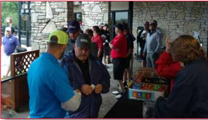
Golfers register for the AGC of Kansas Golf Tournament