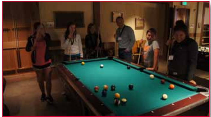
AGC family members enjoying some pool table games