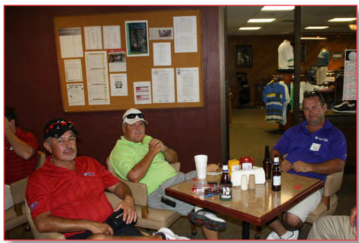
AGC of Kansas members enjoy the day on the golf course