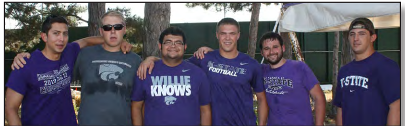
AGC/KSU construction science students