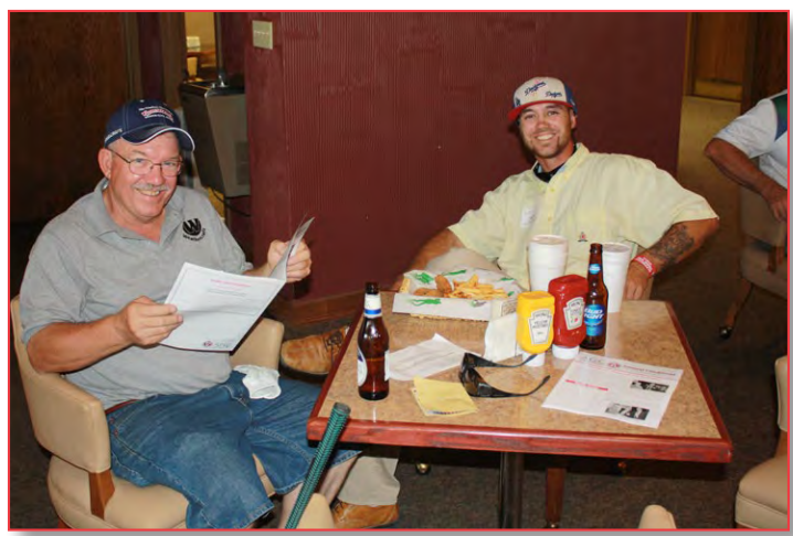
AGC of Kansas members networking