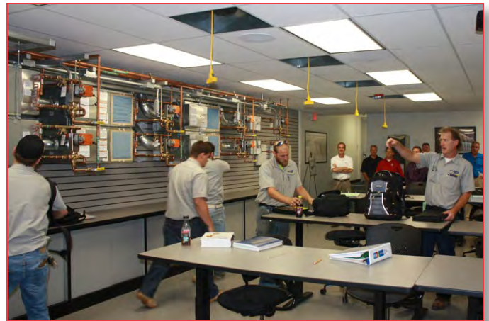
Washburn Tech's Practical Labs