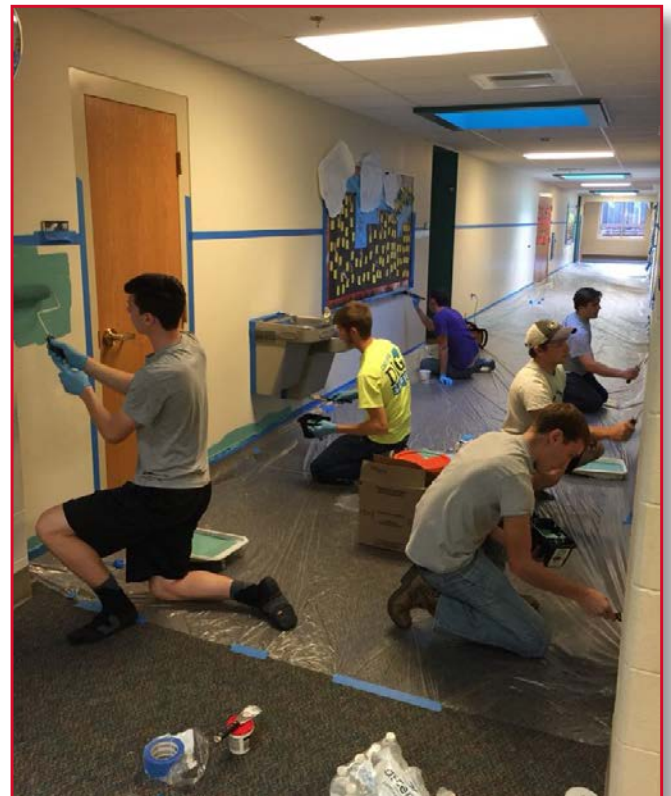
Community Service Project Work