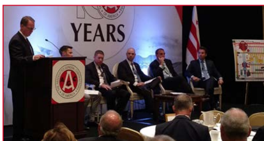
Legislative Update from AGC of America’s Legislative Affairs Staff