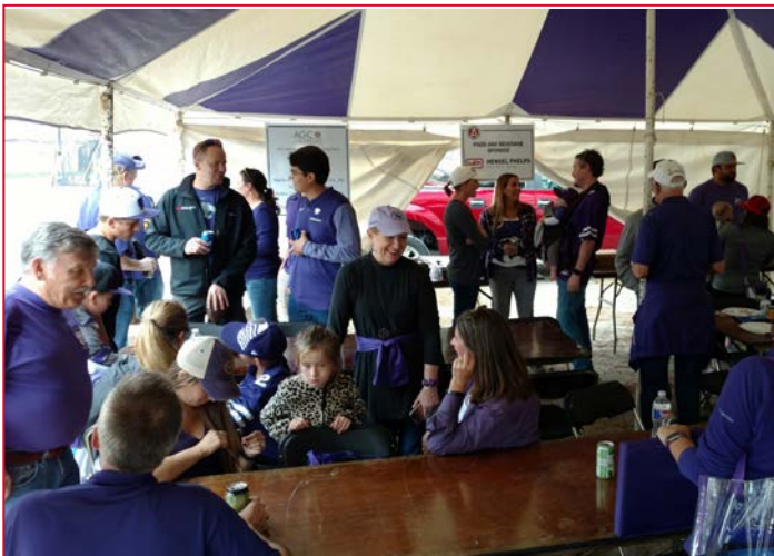
AGC members visit with K-State Students/Faculty