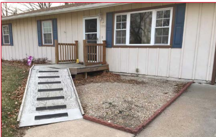
↓ Community Service Project Ramp (Before)