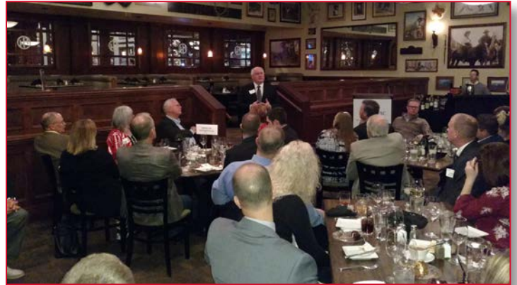
Congressman Estes addresses the VIP Legislative Dinner attendees