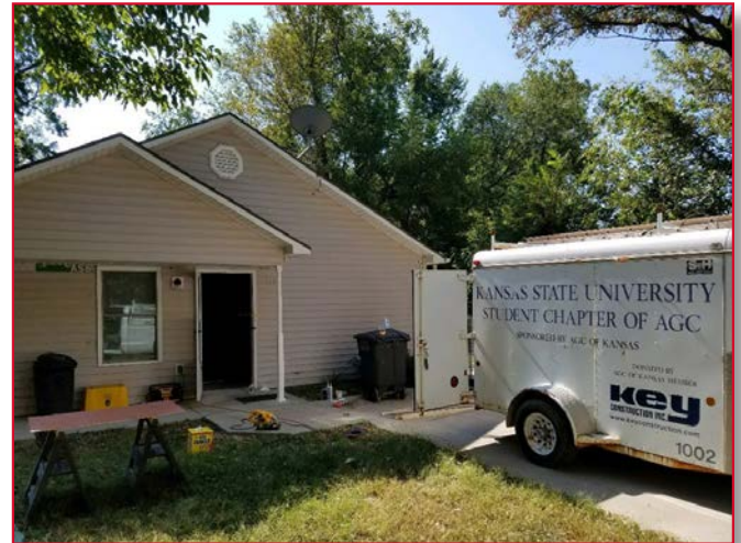
Ogden House Project